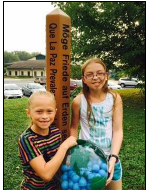
Explorers of the Week are often recognized for displaying virtues.